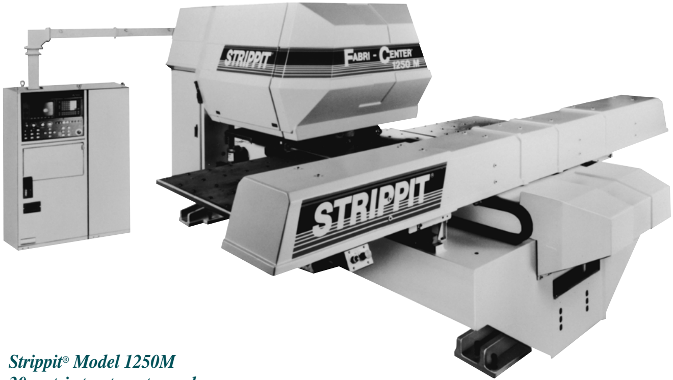
Strippit® Model 1250M 30 metric ton turret punch press uses a Model CBH-4010 clutch-brake