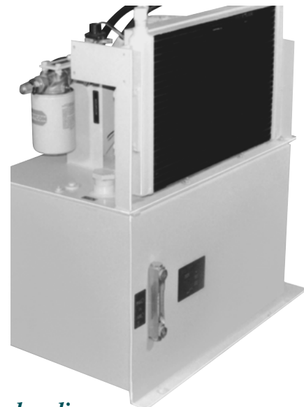
Hydraulic Power Unit