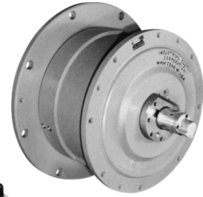
Model CBH Clutch-Brake